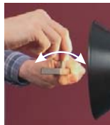
Figure 3. Visual inspection of scraper

If light is visible, the scraper is not suitable for use and should be replaced - see "Spares" on page 9.